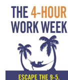
THE 4-HOUR WORK WEEK by Timothy Ferriss