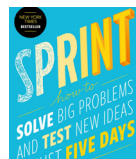
SPRINT by Jake Knapp